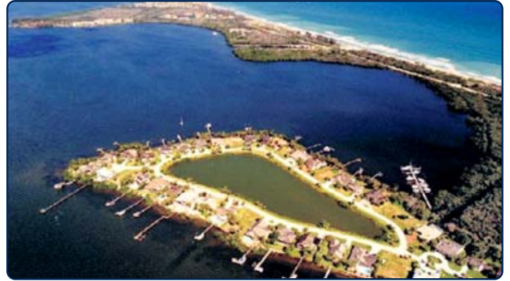
Aerial View of Study Area

Coastal Stems International, Inc., as a subconsultant to Burns and McDonnell, conducted hurricane damage evaluations and provided rehabilitation recommendations for the Martin County, Florida Federal Shore Protection Project. Pre/post storm hydrographic monitoring surveys of the project shoreline were analyzed. Changes in shoreline position and fill volume provided an assessment of project erosion due to Hurricane Irene in October of 1999. Based upon these changes, recommendations were provided relative to upland damage potential and the need for project rehabilitation.