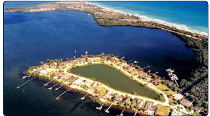
Aerial View of Study Area

Coastal Systems International, Inc., as a subconsultant to Burns and McDonnell, conducted hurricane damage evaluations and provided rehabilitation recommendations for the Martin County, Florida Federal Shore Protection Project. Pre/post storm hydrographic monitoring surveys of the project shoreline were analyzed. Changes in shoreline position and fill volume provided an assessment of project erosion due to Hurricane Irene in October of 1999. Based upon these changes, recommendations were provided relative to upland damage potential and the need for project rehabilitation.