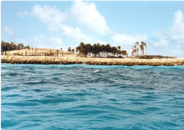
View of Breakwater