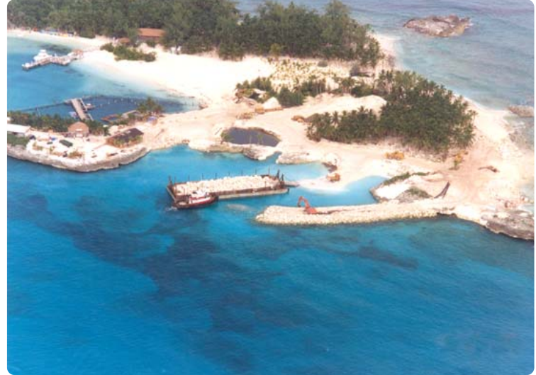
Breakwater Under Construction

Coastal Systems International, Inc. provided coastal engineering services relative to the design of a 500 foot breakwater to create a lagoon. It was the Owner's objective to create a dolphin lagoon on the east side of Salt Cay that would promote a "Swimming with the Dolphins" facility. The project required the creation of both an exterior and interior lagoon that connected with the existing dolphin facility. The design minimized construction costs by utilizing 30,000 tons of rock and 40,000 cubic yards of material excavated from the island's interior. The design also incorporated flushing culverts and a reduced-core elevation to maximize water flow and quality in the lagoon.