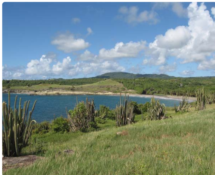
Proposed Project Site