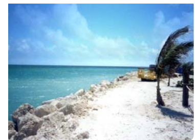
Shoreline Stabilization & Island Terminal Construction