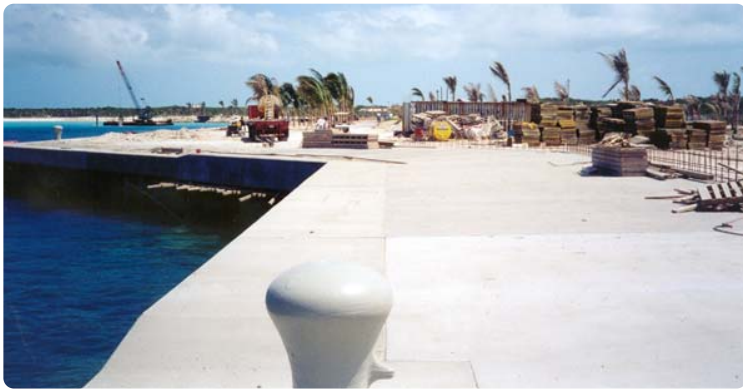
Enlarged Concrete Pile Cap