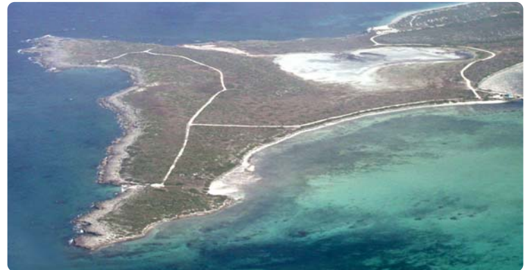
Aerial of Existing Island

Construction of the initial phases of work began in 2004, and initial amenities are scheduled to open in 2007.