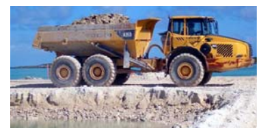
Construction of Entrance Channel in Progress