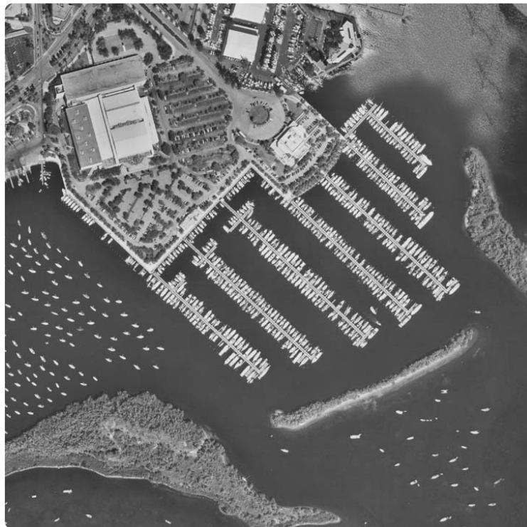
Aerial View of Marina