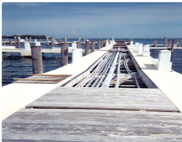
Deck Replacement Construction in Progress