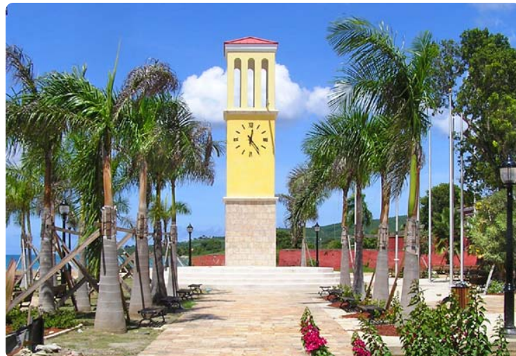
Eliza McBean Clock Tower

Phase II of the project will involve the reconstruction of the community waterfront north of the fort and will include the recreation of breakwaters, the reconstruction of Paul E. Joseph Stadium, and the restoration of the beach, restroom facilities, retaining pond, utilities, parking areas, and soccer fields.